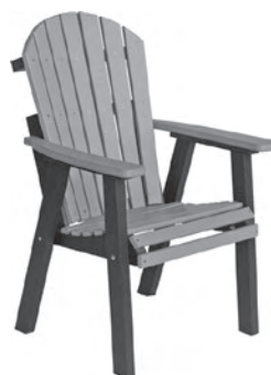
Comfo-Back Dining Chair