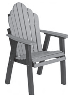
Cozi-Back Dining Chair